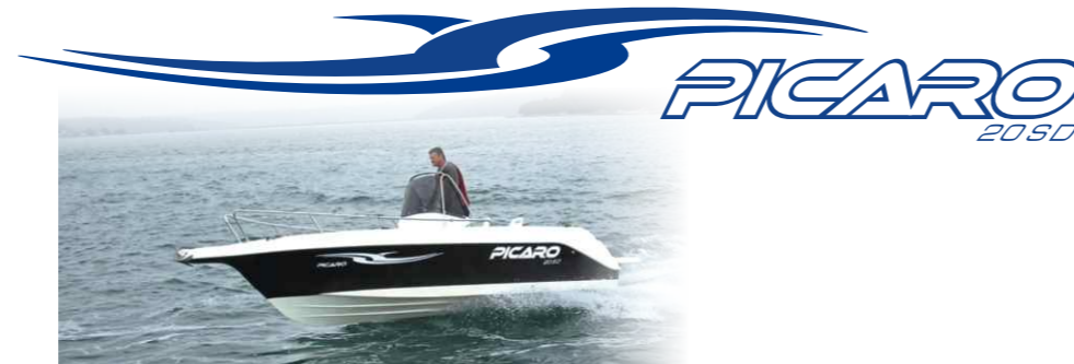
Test sa motorom 135 HP - Test with engine 135HP