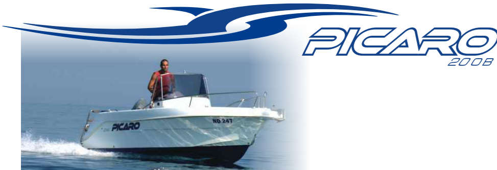
Test sa motorom 140 HP - Test with engine 140 HP