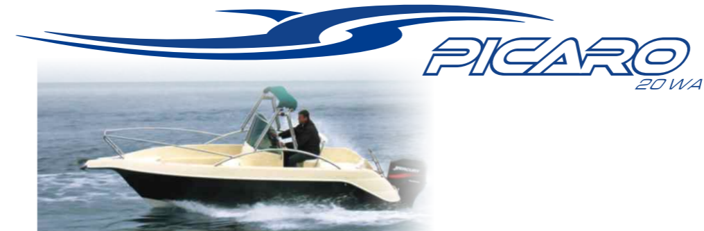
Test sa motorom 90 HP - Test with engine 90 HP